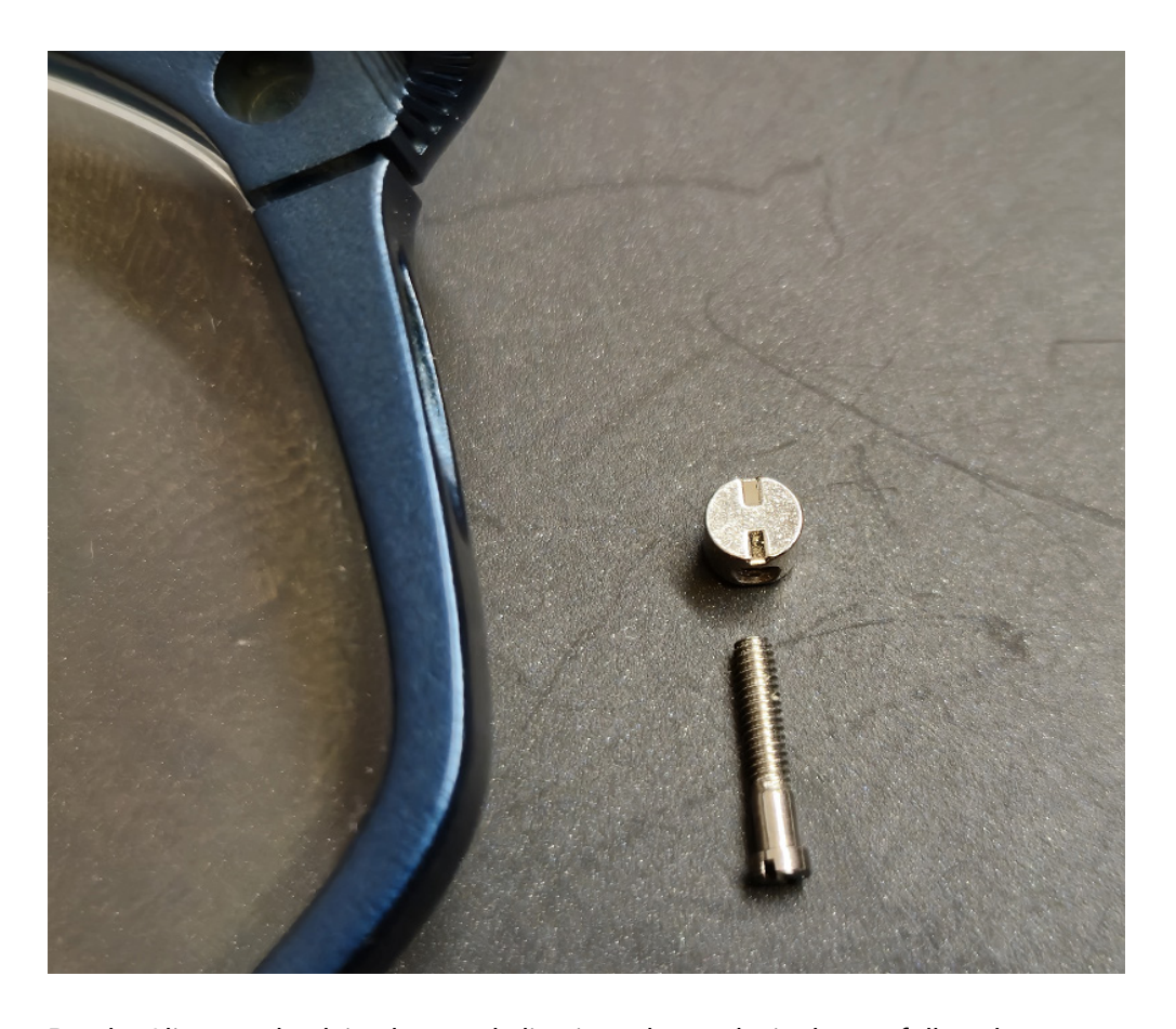
Put the Alium nut back in place and align it so the marks in the nut follow the direction of the screw and then tighten the screw.